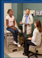
Hear from several of our provider teams as they present real cases